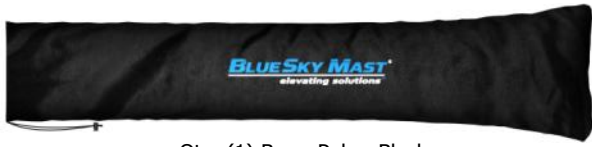
Qty: (1) Bag - Pole - Black P/N: BSM2-B-P400-BAG-BLK 1.1 lbs / .5 kg