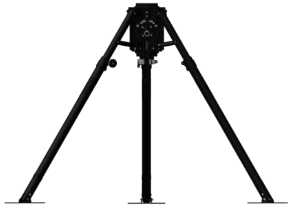
Qty: (1) Tripod with Bolted Lift Winch P/N: BSM2-K-T200-LFT-000 35.0 lbs / 15.2 kg