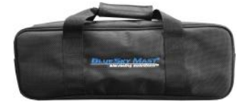
Qty: (1) Bag - Small Accessory - Black P/N: BSM2-B-P610-BAG-BLK 1 lbs / 0.5 kg