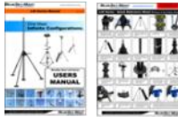
Qty: (1) Reference Pack - Lift P/N: BSM2-L-M503-PAC-000 0.7 lbs / 0.3 kg