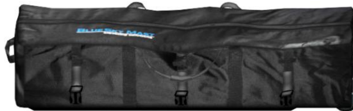
Qty: (1) Wheeling Carry Bag 54 x 14 x 14 Inches P/N: BSM2-B-P305-BAG-3WH 23.7 lbs / 10.8 kg