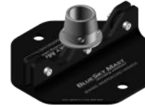
Qty: (1) Base Plate - Lift Kit P/N: BSM2-P-T705-BSP-000 1.6 lbs / 0.7kg