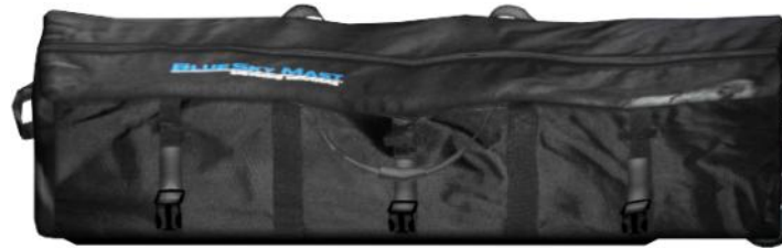
Qty: (1) Wheeling Carry Bag 54 x 14 x 14 Inches P/N: BSM2-B-P305-BAG-3WH 23.7 lbs / 10.8 kg