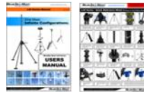
Qty: (1) Reference Pack - Lift P/N: BSM2-L-M503-PAC-000 0.7 lbs / 0.3 kg