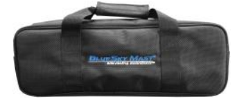
Qty: (1) Bag - Small Accessory - Black P/N: BSM2-B-P610-BAG-BLK 1 lbs / 0.5 kg