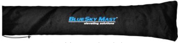
Qty: (1) Bag - Pole - Black P/N: BSM2-B-P400-BAG-BLK 1.1 lbs / .5 kg