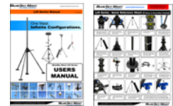
Qty: (1) Reference Pack - Standard P/N: BSM2-L-M501-PAC-000 0.7 lbs / 0.3 kg