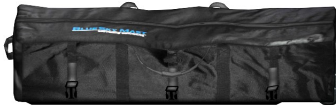
Qty: (1) Wheeling Carry Bag 54 x 14 x 14 Inches P/N: BSM2-B-P305-BAG-3WH 23.7 lbs / 10.8 kg