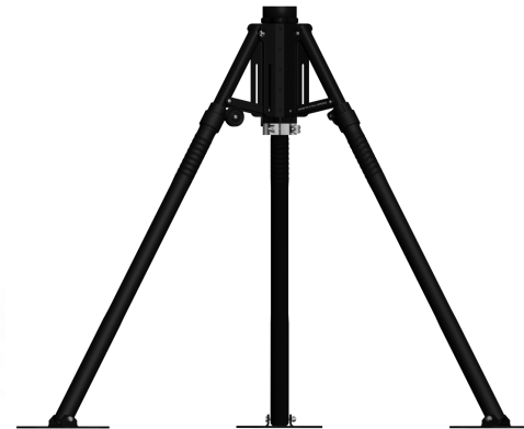
Qty: (1) Tripod with Base Plates P/N: BSM2-P-T200-POD-000 18.0 lbs / 8.2 kg