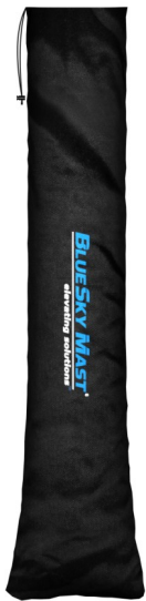
Qty: (1) Bag - Pole - Black P/N: BSM2-B-P400-BAG-BLK 1.1 lbs / 0.5 kg (each)