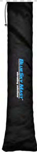
Bag - Pole - Black P/N: BSM2-B-P400-BAG-BLK 1.1 lbs / .5 kg