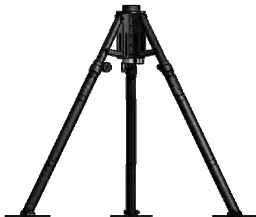
Tripod with Base Plates P/N: BSM2-P-T200-POD-000 16.7 lbs / 7.6 kg