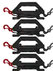
Qty: (4) 8M - Guy Rope - Primary P/N: BSMU-P-G608-PRI-RED 0.6 lbs / 0.3 kg (each)