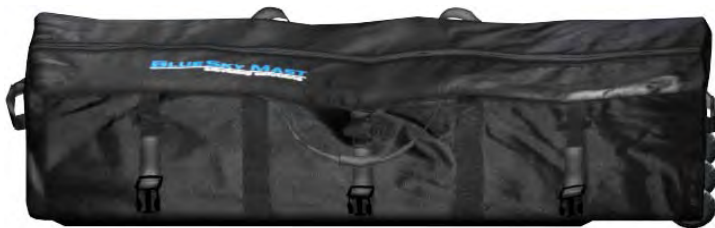
Wheeling Carry P/N: BSM2-B-P305-BAG-3WH 23.7 lbs / 10.8 kg