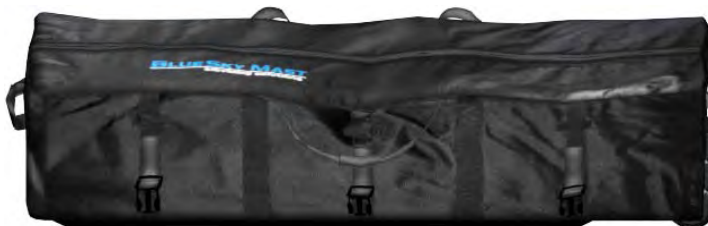
Wheeling Carry P/N: BSM2-B-P305-BAG-3WH 23.7 lbs / 10.8 kg